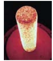
Ceramic Radiant Burner