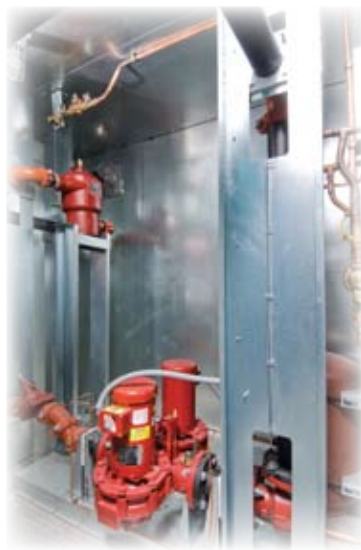
Factory Installed Boiler Building Pump