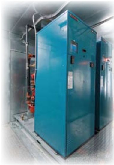
Factory Installed Boiler