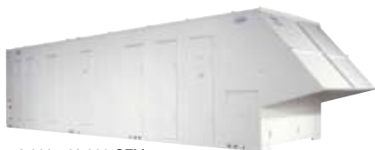
18,000 - 68,000 CFM