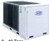
8 - 40 Tons