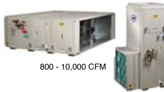
800 - 10,000 CFM