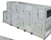
1,000 - 16,000 CFM