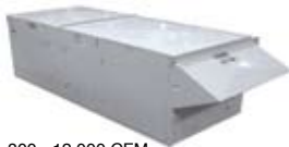
800 - 12,000 CFM