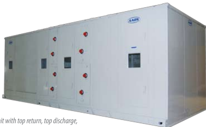
M3 Series Unit with top return, top discharge, hot water coils, and chilled water coils.