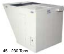
45 - 230 Tons