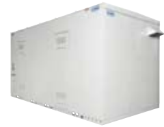
500 - 6,000 MBH