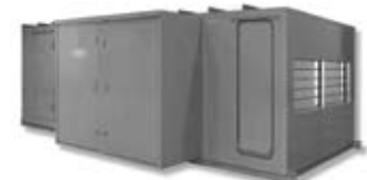
1,500 - 218,000 CFM • Indirect Fired