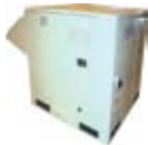
800 - 2,000 CFM