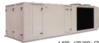
1,500 - 120,000+ CFM