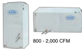
800 - 2,000 CFM