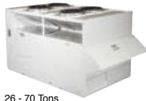
26 - 70 Tons