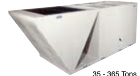
35 - 365 Tons