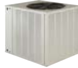
2 - 5 Tons