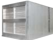
16,000 - 51,500 CFM