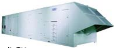
45 - 230 Tons