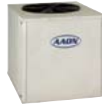
2 - 5 Tons