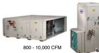
800 - 10,000 CFM

It is the intent of AAON to provide accurate up-to-date specification data. However, in the interest of ongoing product improvement, AAON, Inc. reserves the right to change specifications and/or design of any product without notice, obligation, or liability.