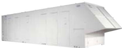
18,000 - 68,000 CFM