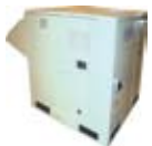
800 - 2,000 CFM