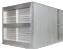
17,000 - 52,000 CFM