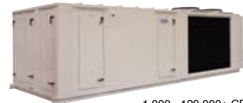
1,000 - 120,000+ CFM