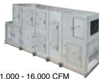
1,000 - 16,000 CFM