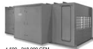
1,500 - 218,000 CFM