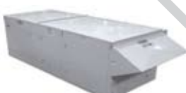
800 - 12,000 CFM