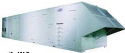
45 - 230 Tons