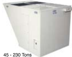
45 - 230 Tons