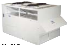
26 - 70 Tons