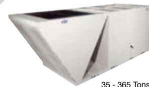
35 - 365 Tons