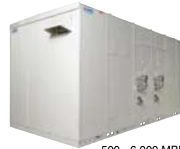
500 - 6,000 MBH