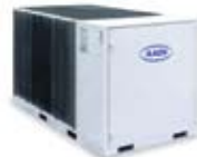
7.5 - 40 Tons